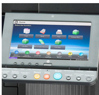
New 9" Touchscreen