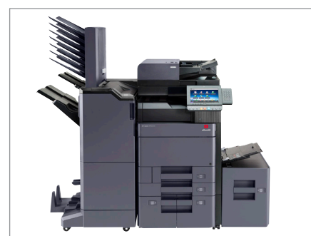
The Olivetti d-Copia 6000MF with DP-7110+PF-7110+PF-7120+DF-7110+BF-730+MT-730